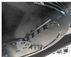
Replaceable carbide teeth on bottom of blade carrier.